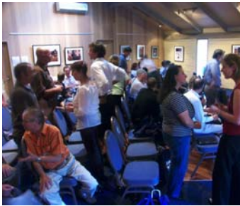
Networkers at work!